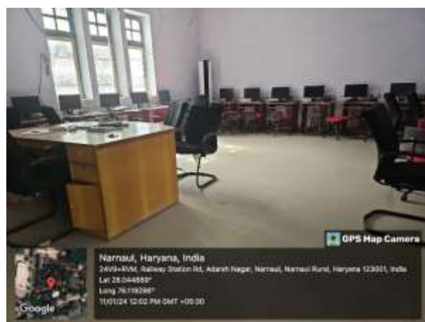
Digital Lounge Computer Lab- Room no. 45